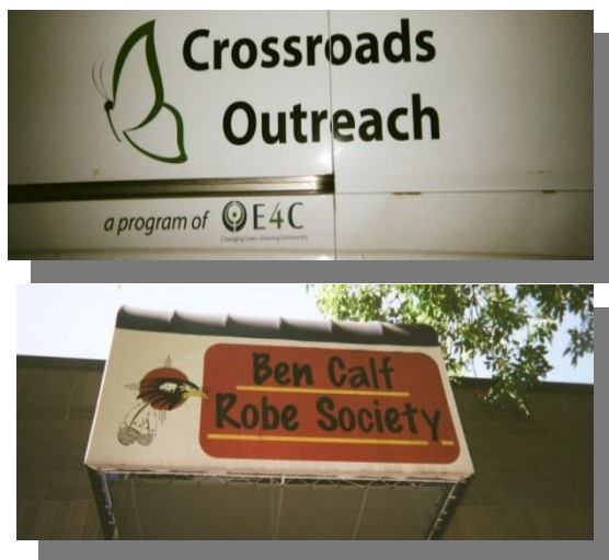
Figures 1 and 2

Crossroads was a really big help in my life. After I had my baby I started coming to Ben Calf, and that's been a really good experience.