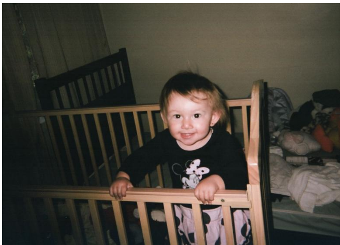
Figures 12 and 13