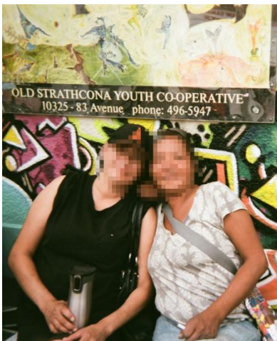
Figure 15 and 16