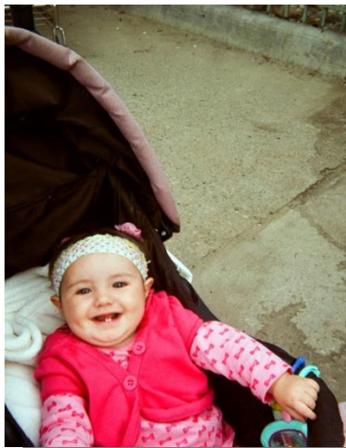
Figures 9 and 10