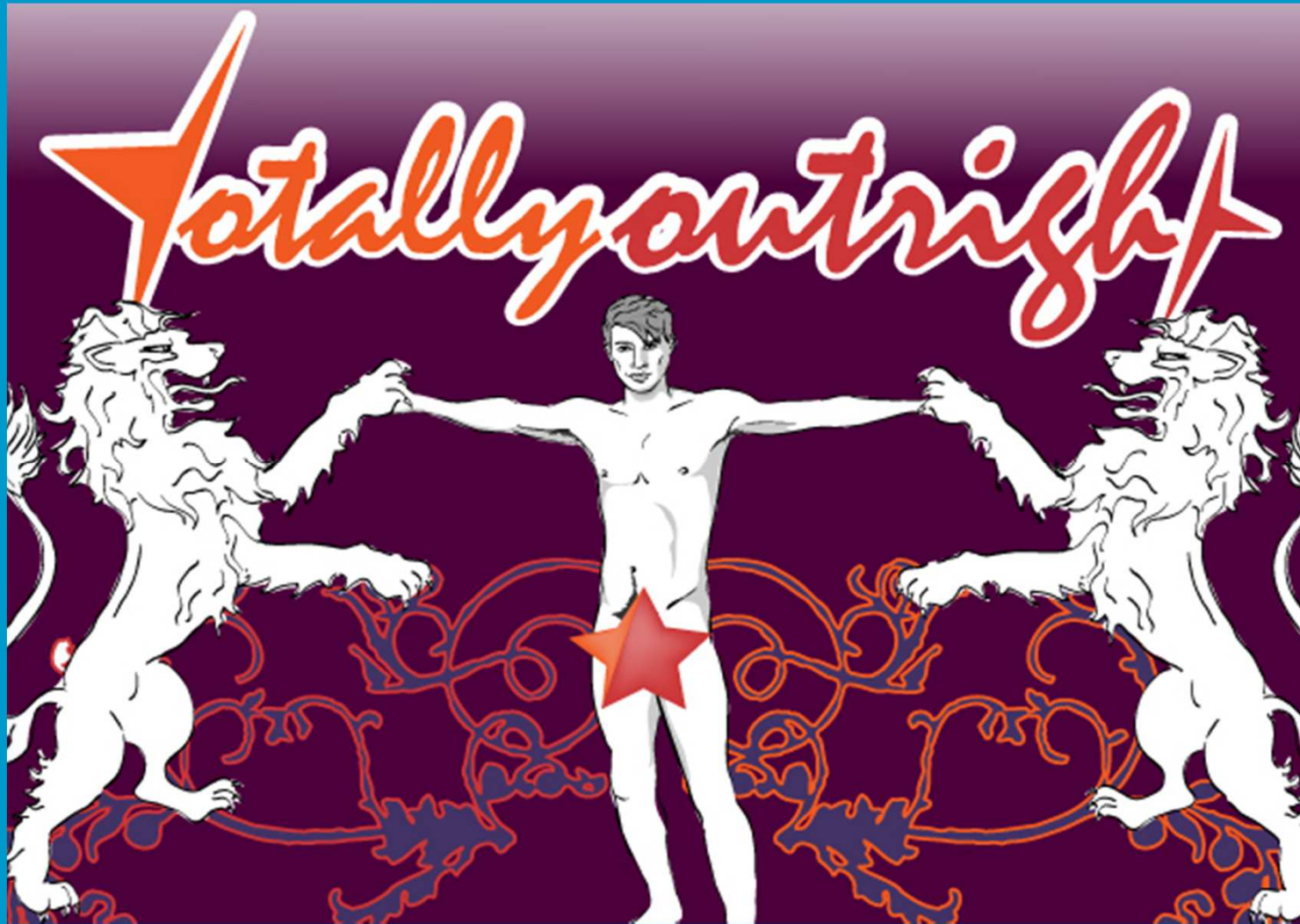
Totally Outright Recruitment Poster