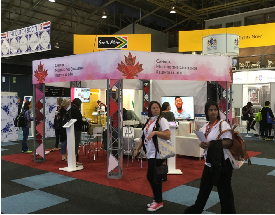
Image 4: Interior Space (during opening session)